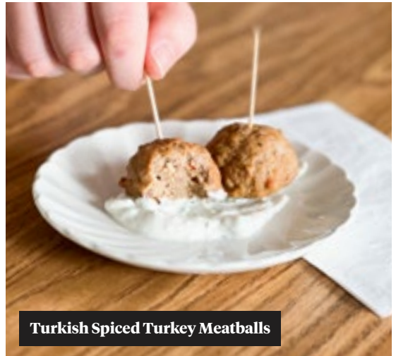
Turkish Spiced Turkey Meatballs