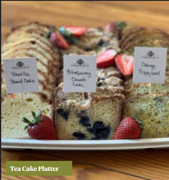
Tea Cake Platter