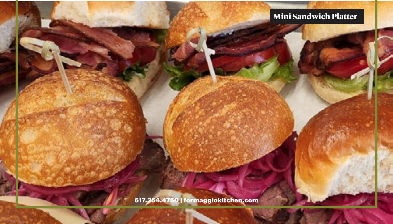
Mini Sandwich Platter

(V) Vegetarian | (GF) Gluten-Free | (NF) Nut-Free