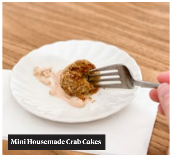
Mini Housemade Crab Cakes