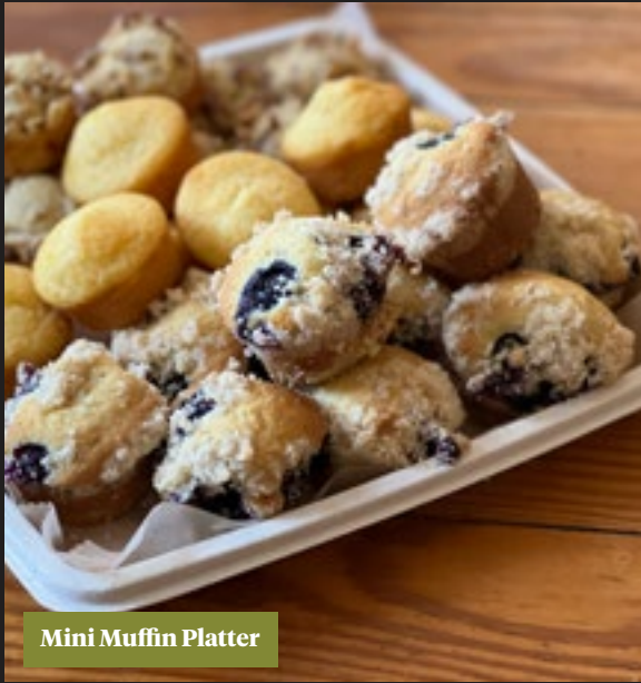
Mini Muffin Platter