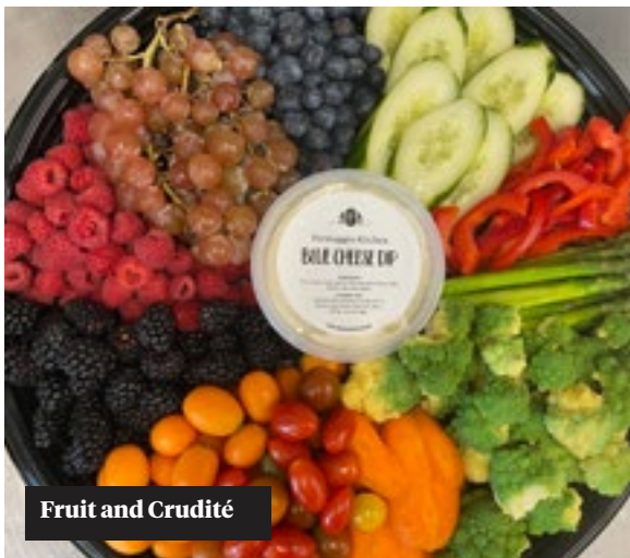
Fruit and Crudité