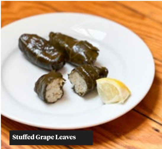
Stuffed Grape Leaves