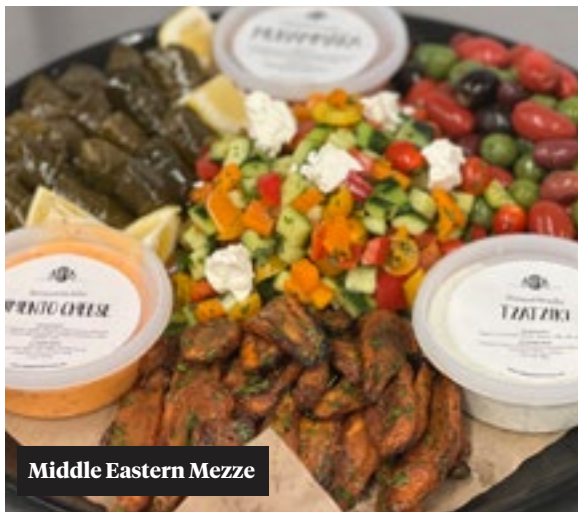
Middle Eastern Mezze