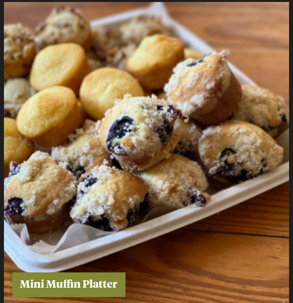
Mini Muffin Platter