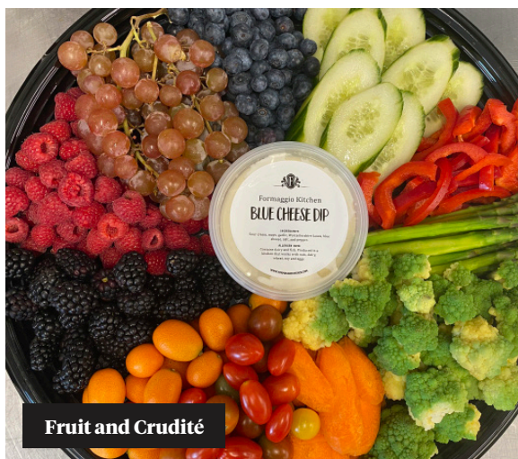
Fruit and Crudité