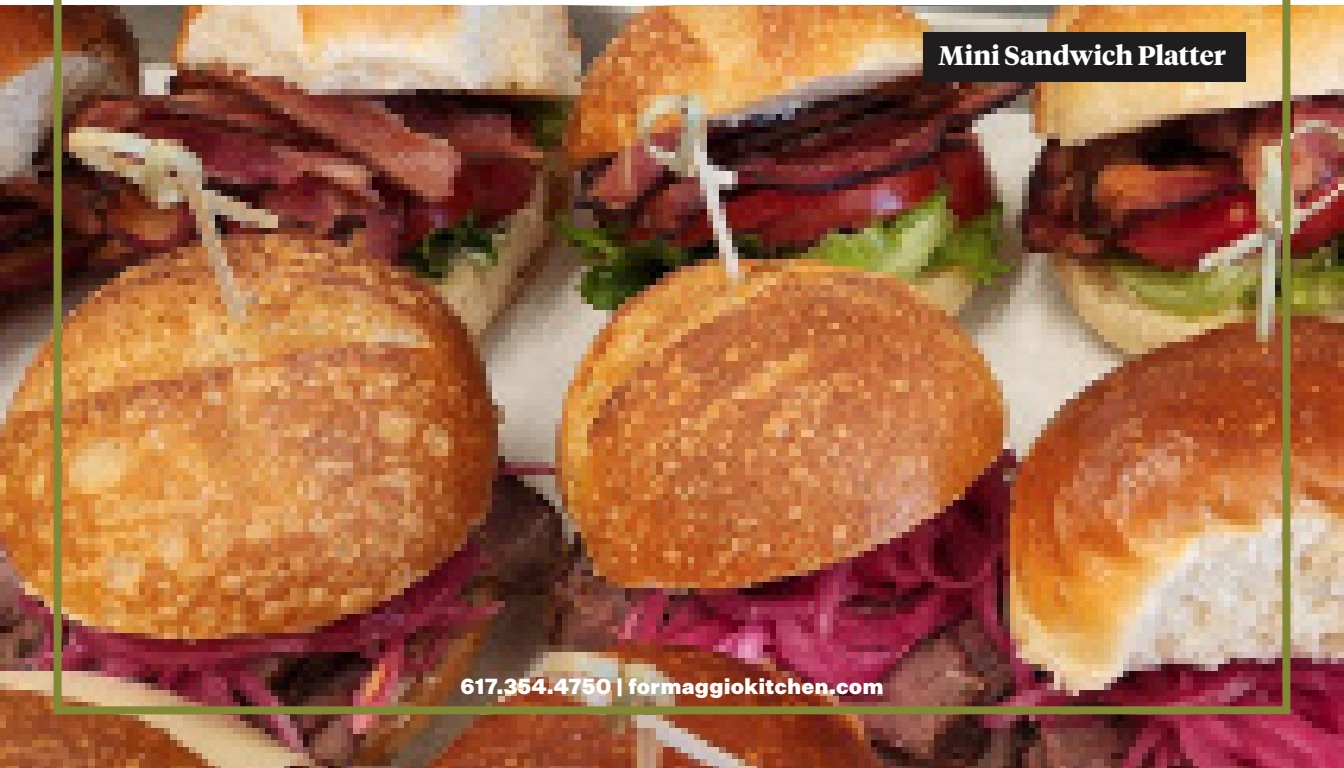
Mini Sandwich Platter

(V) Vegetarian | (GF) Gluten-Free | (NF) Nut-Free